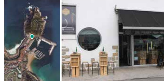
In the port of Getaria